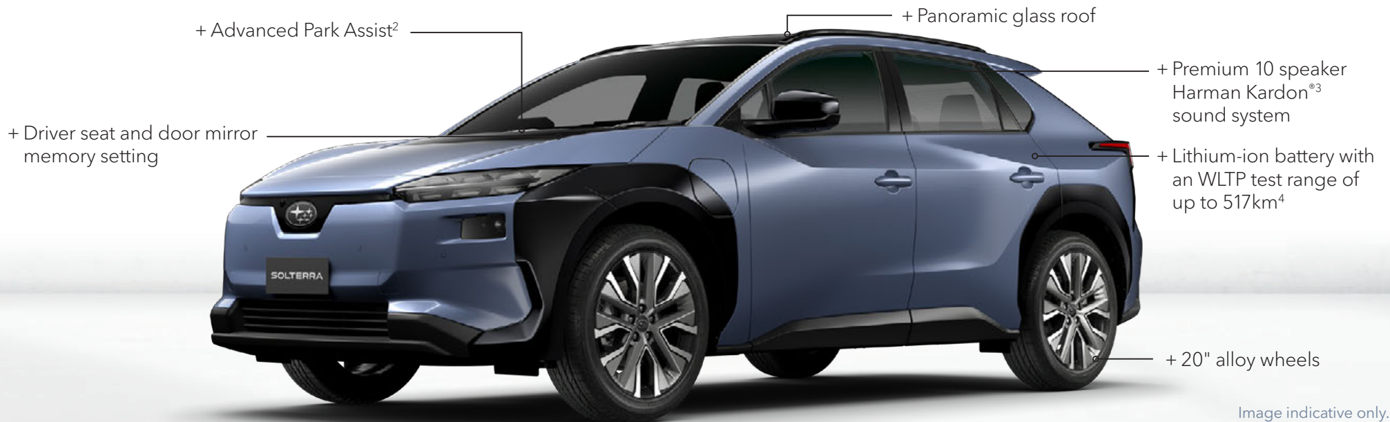
Image indicative only. Optional premium paint shown.

1. The Driver Monitoring System (DMS) features for Solterra are distraction warning and drowsiness warning. DMS performance and capability is dependent on environmental and technical conditions. Refer to Owner's Manual for full details. 2. The Advanced Park Assist system is designed to support the driver but has limitations in recognition accuracy and control performance. It is the driver's responsibility to remain aware of the vehicle's surroundings, including pedestrians and other vehicles, and drive safely. For more information, please consult the Owner's Manual. 3. Harman Kardon ® is a registered trademark of HARMAN International Industries, Incorporated. Available on Subaru Solterra AWD Touring only. 4. Figure based on combined average city and highway cycle test under Australian Design Rule (ADR) 81/02. Range figure is based on laboratory test results only using standardised testing conditions which measure fuel consumption, energy consumption, and carbon emission (as applicable). Real world results may vary based on individual driving circumstances e.g., traffic conditions, driving style, vehicle modifications, fuel quality, climatic conditions, etc. Quoted figures may not reflect real world fuel consumption, energy consumption, and carbon emission.